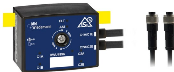
Fig.: In the new ASi-5 counter module ( BWU4996 ) in IP67, the inputs and sensors are supplied out of ASi, and the peripherals are all supplied via 2x M12 cable sockets (5 poles).

Now, you can also use the proven ASi-5 technology of our counter modules in the cable duct, thanks to the newly compact redesigned ASi-5 counter module BWU4996 . Previously, all ASi-5 counter modules offered four 2-channel counter inputs. The BWU4996 expands our product portfolio by offering two 2-channel counter inputs . This allows you to tackle small applications even more flexibly and cost-effectively . Unused counter inputs can also be configured as digital inputs .